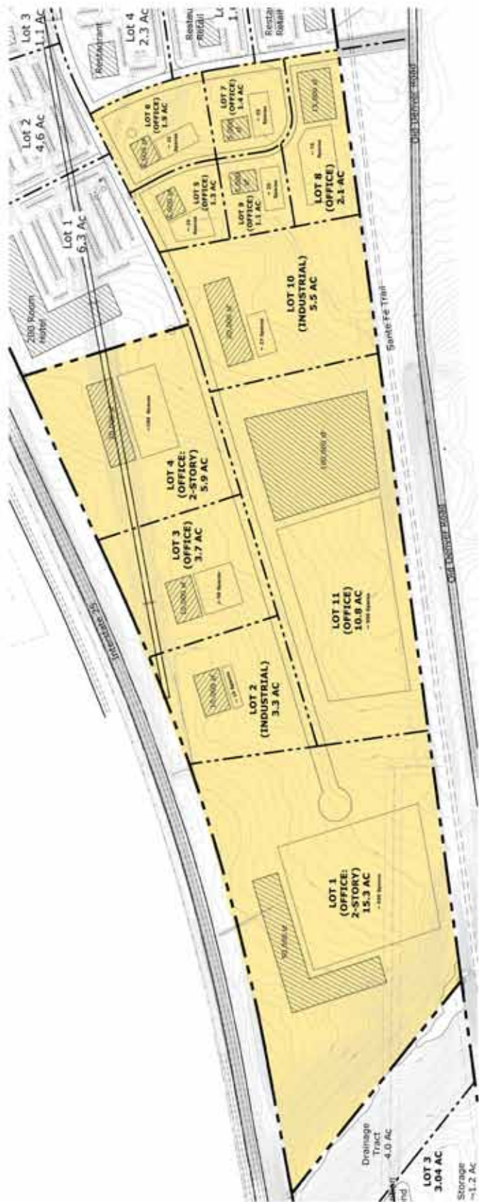
INDUSTRIAL/COMMERCIAL PARCEL [52.3 Acres]

NWC Baptist Road and I-25, Monument, CO 80132